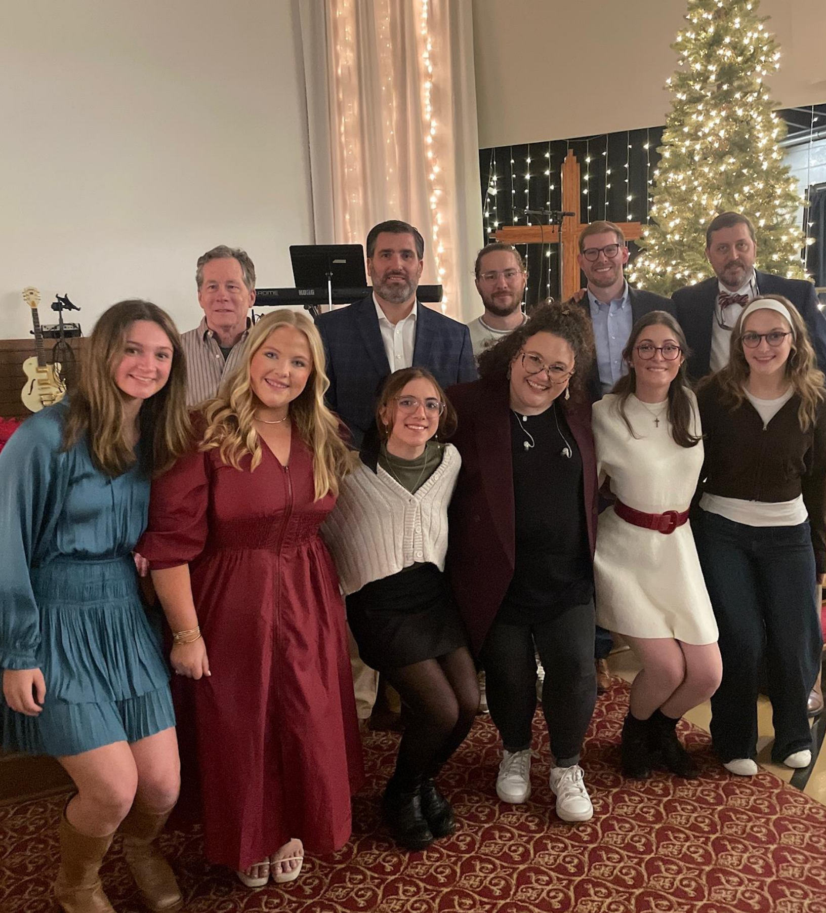
The Dauphin Way UMC Contemporary Worship Band on Christmas Eve 2024