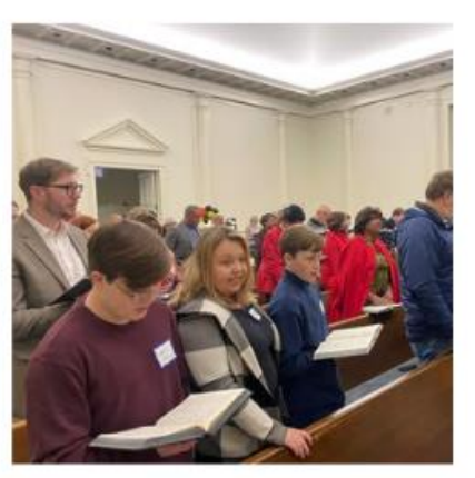
Justice or Just Us Closing Gathering with Legacy Church in Adkins Chapel, February 23, 2025